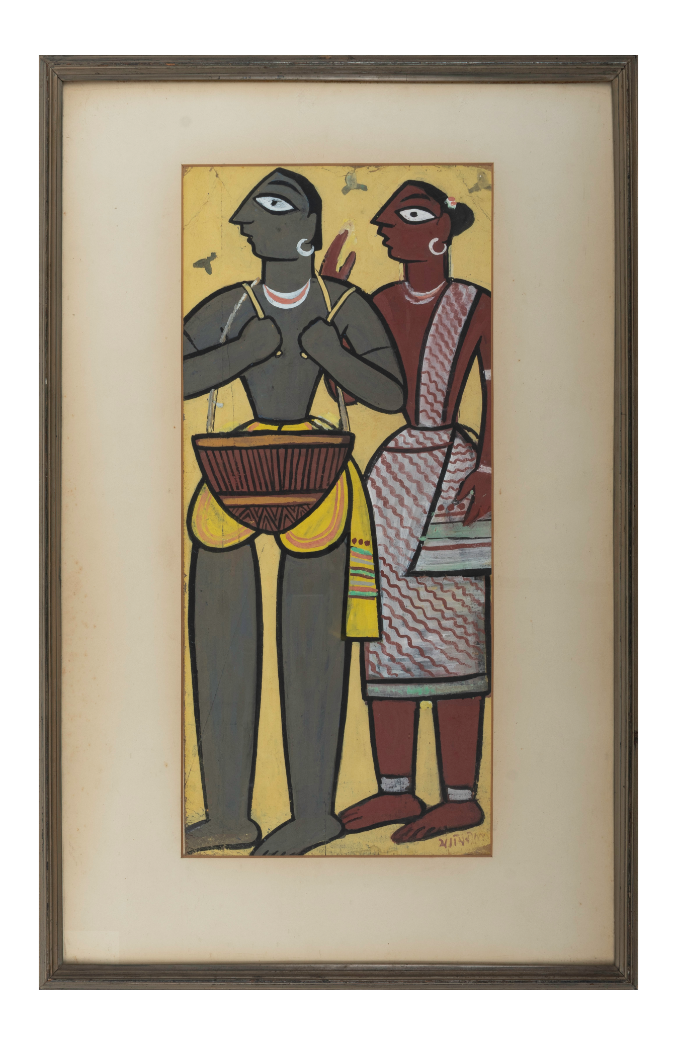
OVERLEAF, Untitled by Jamini Roy Original Artwork - Tempera on Box Board 23.5" x 10.5" | 1920s