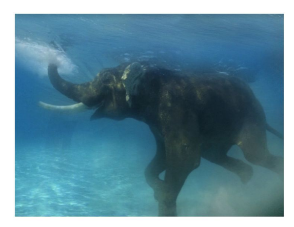
Sheba Chhachhi, Water Diviner